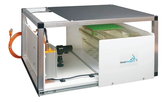
ActualHCA Mouse Desktop

ActualHCA gathers data 24/7 in the least invasive way possible. The technology is a modular, scaleable and universal solution which can be installed in all animal facilities.