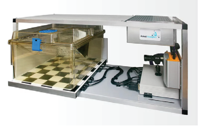
ActualHCA Rat Desktop