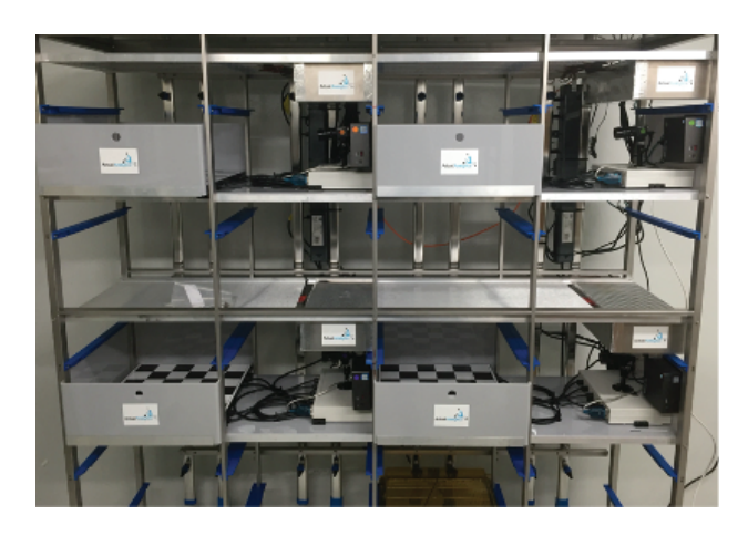
ActualHCA Rat Rack Installed