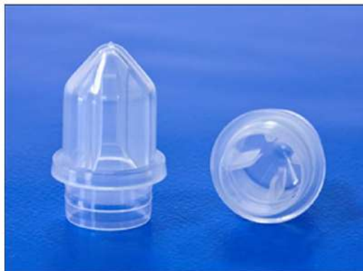
Figure 2: Spin+Collect™

The Spin+Collect™ (Figure 2) has 4 internal fins to expose the maximum surface area of the swab whilst the sample is being eluted from the swab. Furthermore, the fins grip the swab tightly so that the swab is removed together with the vessel in a single rapid step (Figure 3).