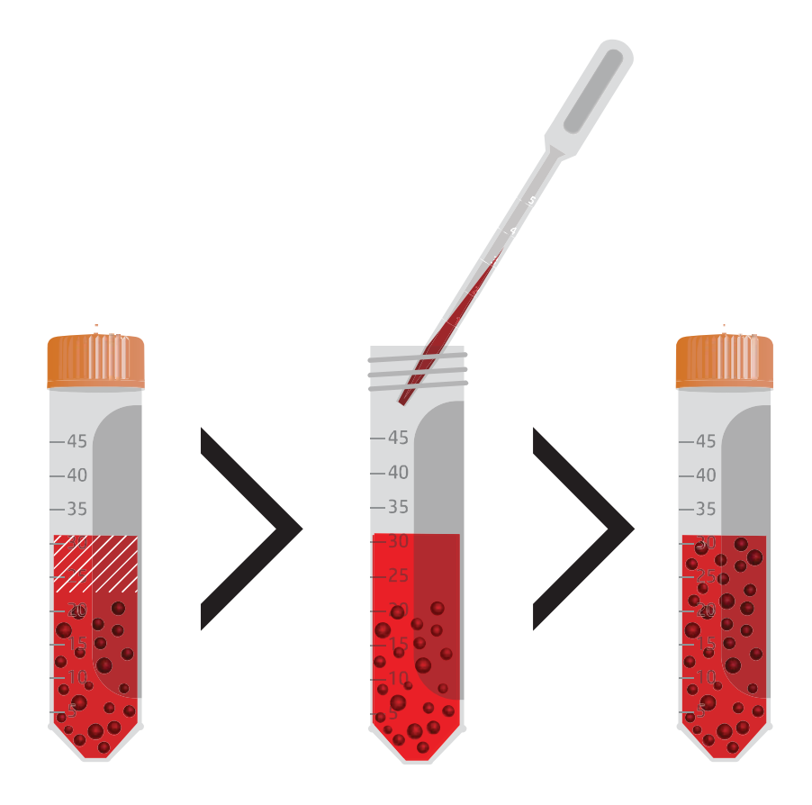
Figure 1. Media replacement using Happy Cell® ASM in either bioreactor tubes or microtiter plates.