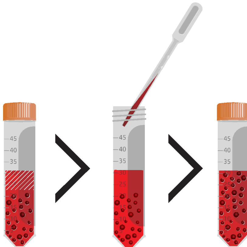
Figure 1. Media replacement using Happy Cell ® ASM in either bioreactor tubes or microtiter plates.